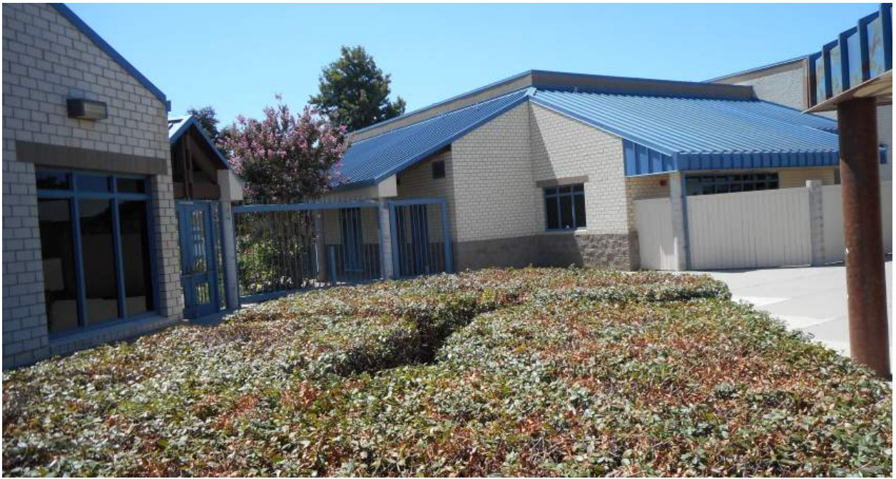
1315 Woodcreek Way, Stockton, CA 95209