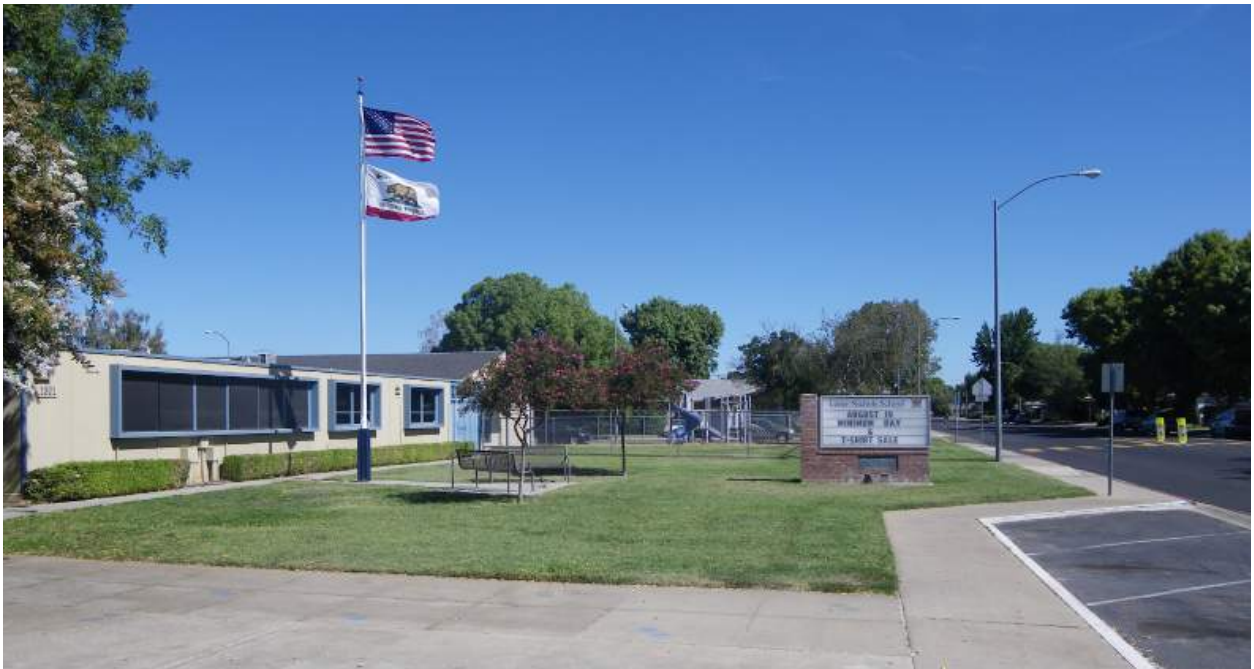
1301 S. Crescent Avenue, Lodi, CA 95240