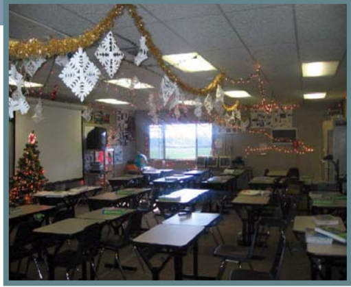
Paper on Walls and Hanging From the Ceiling Can Result in Rapid Spread of Fire