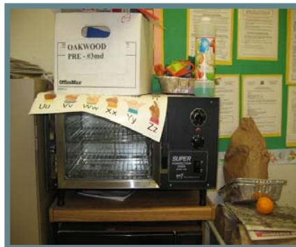
Cooking Appliances Provide a Source for Fire