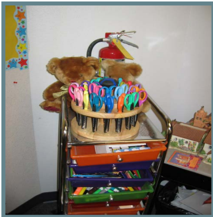
Keenan Fire Extinguishers Can't Be Used Associates if They Are Blocked