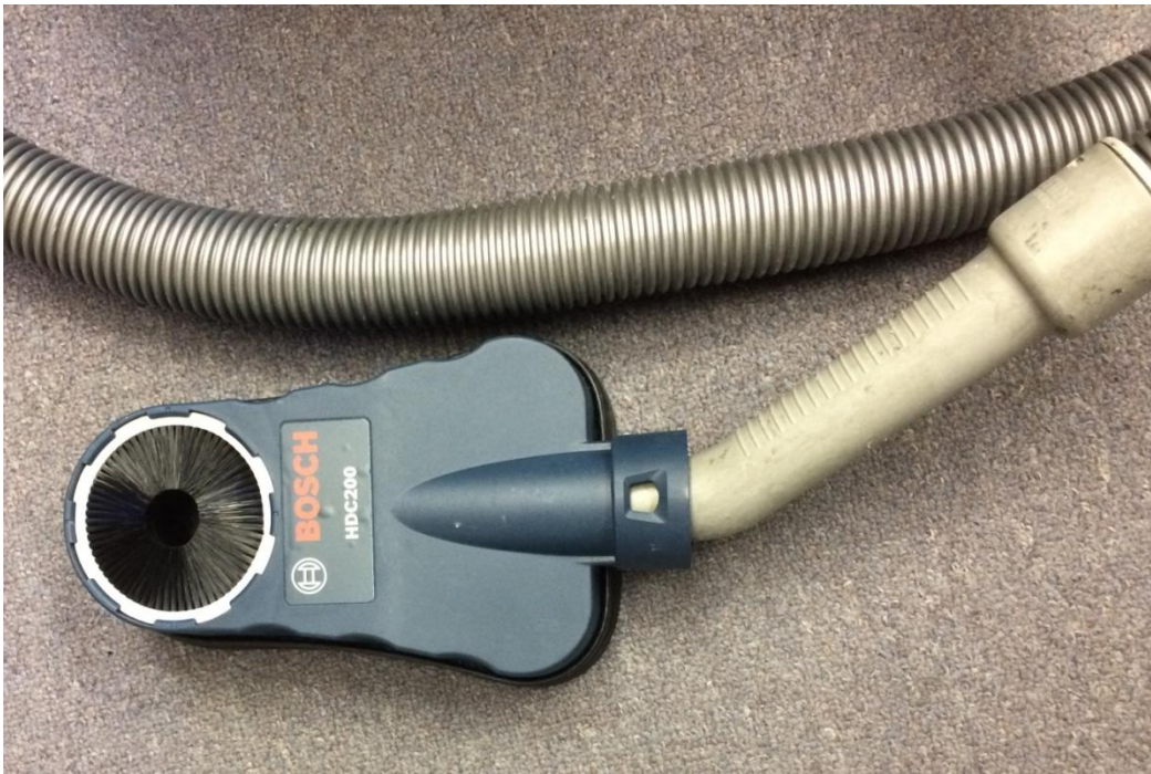
BOSCH HDC200 Shroud attached to a HEPA Vacuum