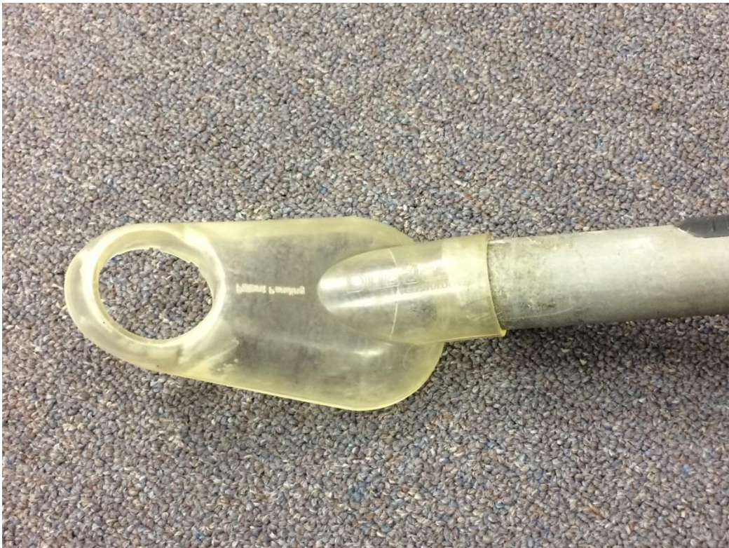
Bit Buddy Shroud attached to a HEPA vacuum